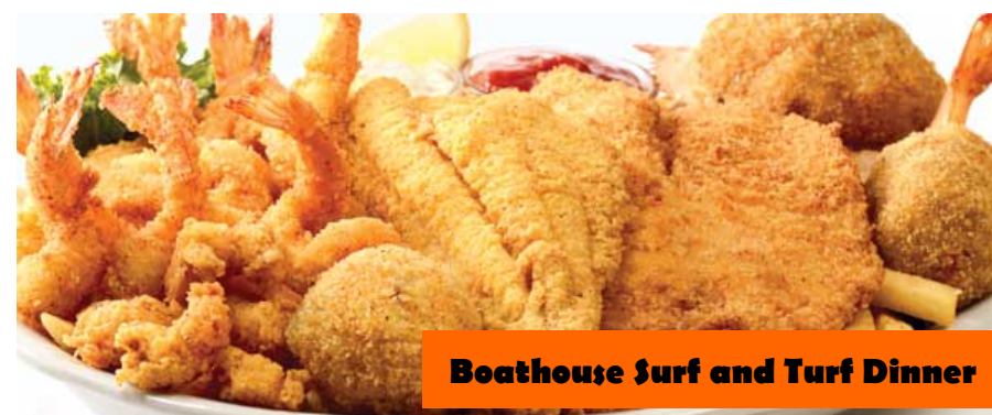
Boathouse Surf and Turf Dinner

Choose from our 'Add on Menu' and make it a feast