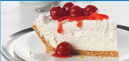
Cherry Cheesecake / 10.79