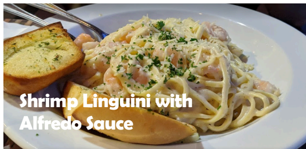
Shrimp Linguini with Alfredo Sauce