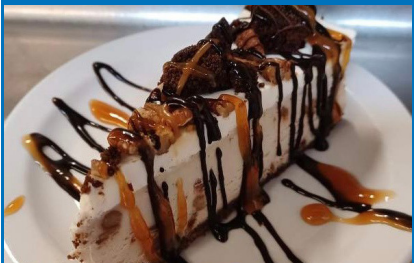
Turtle's Cheesecake (Gluten Free) / 10.79