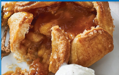
Apple Blossom a la mode / 10.79