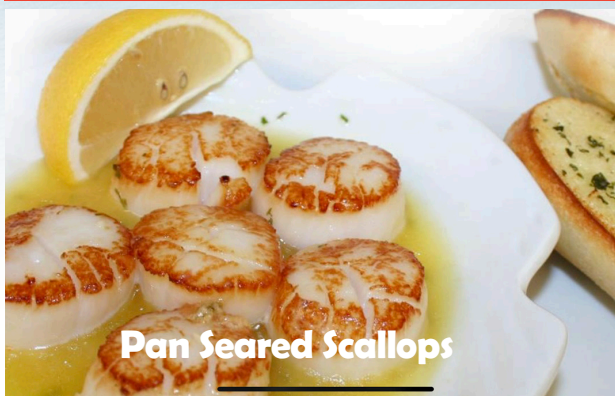
Pan Seared Scallops