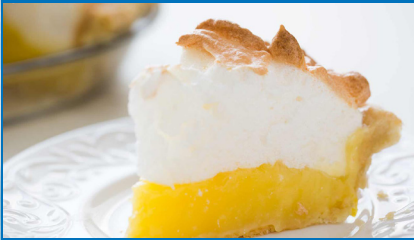
Lemon Meringue Pie / 8.79