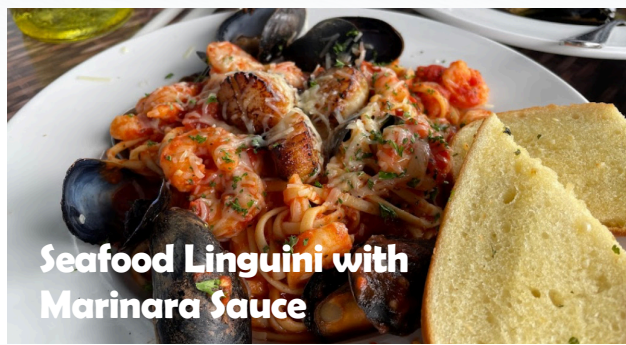
Seafood Linguini with Marinara Sauce