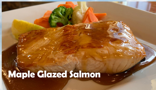
Maple Glazed Salmon

A classic Louisiana dish. Your choice of mild, medium or hot with shrimp, chicken, spicy andouille sausage and rice. / 30.99