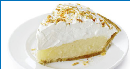
Coconut Cream Pie / 7.79